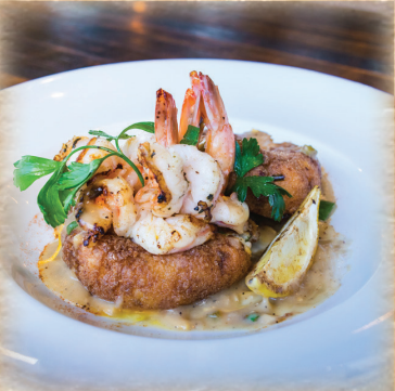
SHRIMP & CHEDDAR GRITS